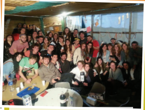
Sukkot with NOAM Argentina directors at Or Jadash.