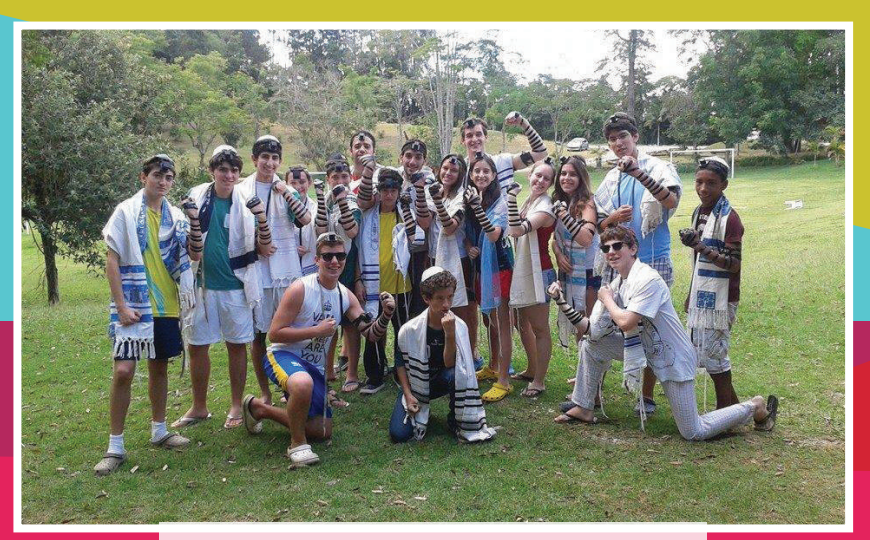
NOAM Summer camp in Brazil.