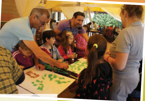
Ukraine family camp.