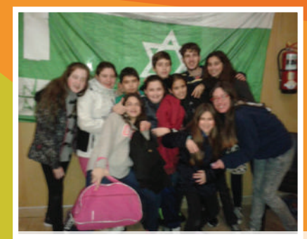
Noam Argentina held the second Yom Tnuah. The fifth and sixth graders from local Jewish schools represented eight communities.