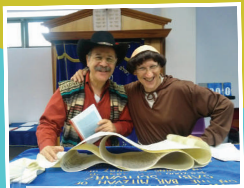
Purim at Kehilat Nitzan in Melbourne, Australia.