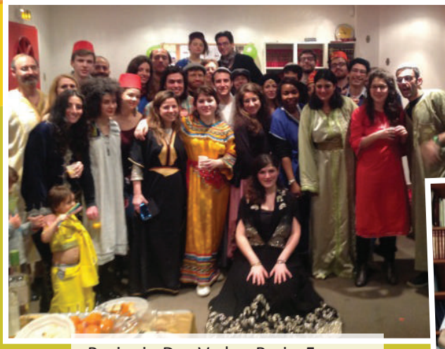
Purim in Dor Vador, Paris, France.