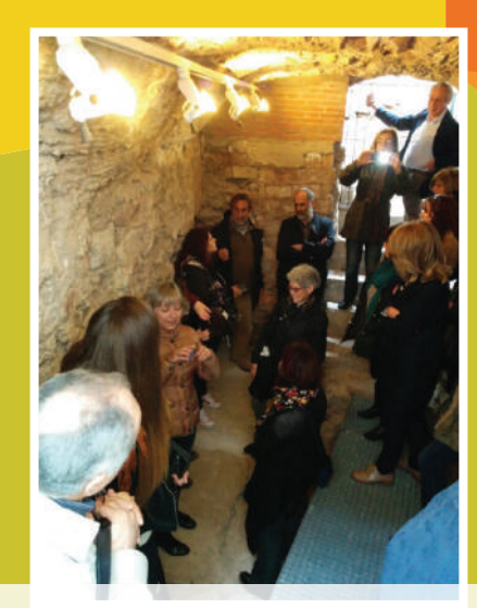
Masorti Europe meets in Valencia, Spain.