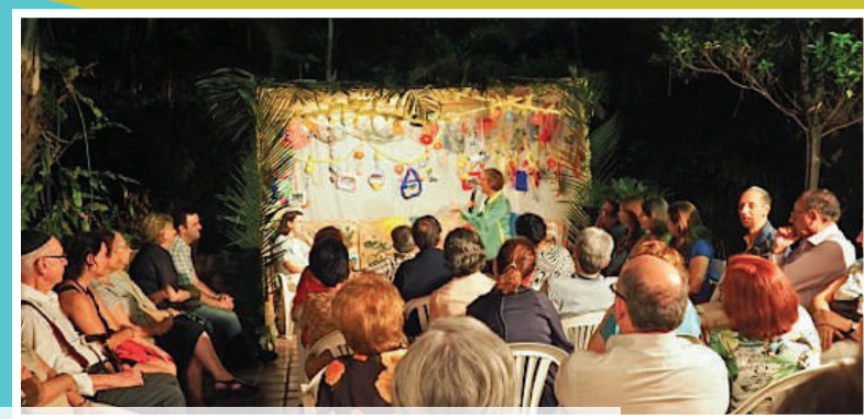
Sukkot at the Shalom community in Sao Paulo, Brazil.